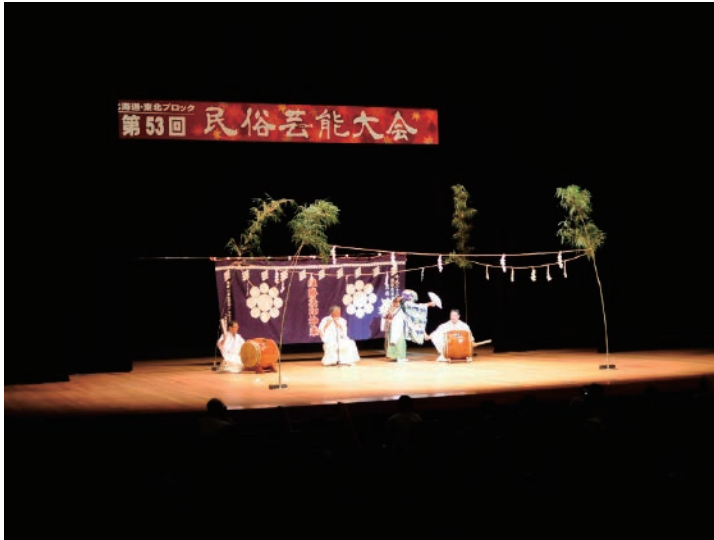
Figure 2 Ogatsu-hoin-kagura being performed on stage.

Figure 2 shows Ogatsu-hoin-kagura being performed on stage. You can see that the atmosphere in which it is performed differs greatly from the community festival we saw on Figure 1. For a folk performing art that has been held and transmitted in local communities, in particular, becoming cultural heritage means that it is separated from the local community to be performed on a stage, as seen here. This is because this particular component of the event is what has been defined as cultural heritage. Therefore, ‘heritagization of culture’ also means that the element could be preserved independently of the local community.