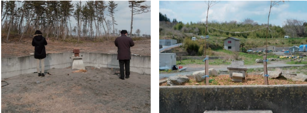
Figure 4 A small shrine for Myojin-sama inside the remnant of a house (left); and the one seen in Minamisanriku-cho.

looks like the members of the household that worshiped this shrine were all killed in the tsunami, and the neighbors have re-enshrined this god, even though the people who had once looked after it are gone.