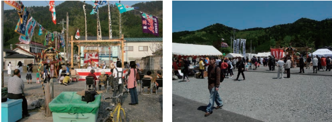
Figure 1 Ogatsu-hoin-kagura before the Great East Japan Earthquake and Tsunami Disaster (left); and the festival in the same community that was resumed in 2012 (right). Note that the latter is more crowded with visitors outside the local community.

Ogatsu-hoin-kagura was embedded within everyday life. It was not something that you sat and watched with full attention.